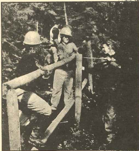
Lewis and Clark College students work on the railing project near Hardy Creek Falls.