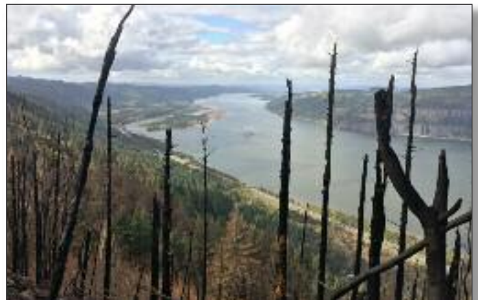
Looking west from Angel's Rest